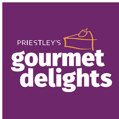
Reverse Colour Option 1