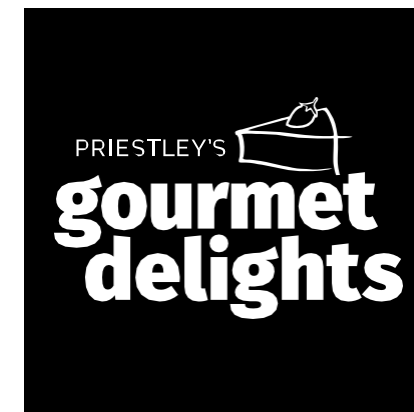
Reverse Mono Logo