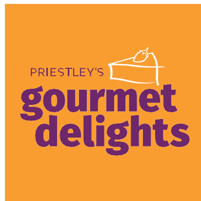
Reverse Colour Option 1